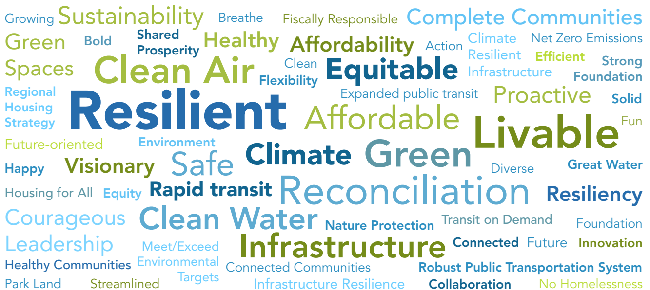
Word cloud generated by Board of Directors when asked to share their vision of the region in 2050

Metro Vancouver will continue to engage with members on processes and initiatives that contribute to an effective and well-functioning organization. Metro Vancouver will strengthen awareness of the services it provides, and continue to engage with the public, members, other orders of government, interested and affected parties, and First Nations on a range of initiatives that support Metro Vancouver's services.