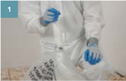
1 Twist the unused top portion of the bag into a tail.

Only used gypsum program bags tied goose-neck style following these instructions will be accepted for disposal.