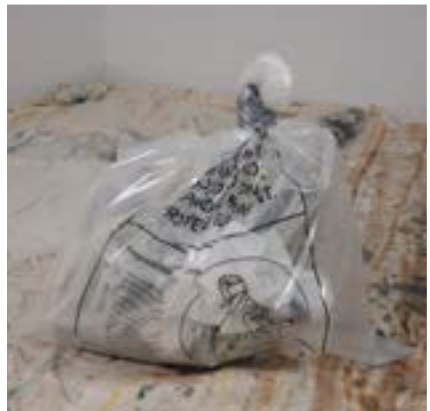
DOUBLE BAGGED WITH THIS BAG ONLY

Call 604-681-5600 or go to metrovancouver.org and search “used gypsum bag”