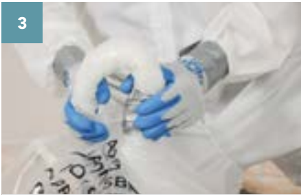
3 Take the leftover twisted tail section of the bag and bend it around to make a loop.