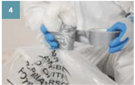
4 Attach it to the base of the tail using duct tape.

Residents may drop off used gypsum for disposal at Metro Vancouver recycling and waste centres or the Vancouver Landfill. Used gypsum is NOT accepted at the Vancouver South Transfer Station or any gypsum recycling facilities.