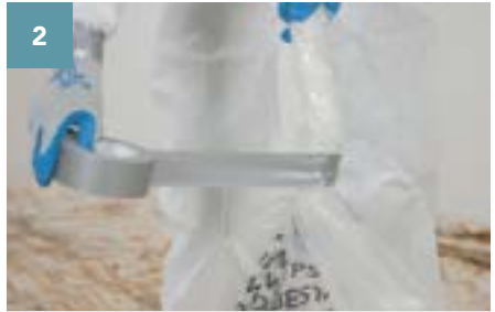
2 Seal the base of the tail with duct tape.