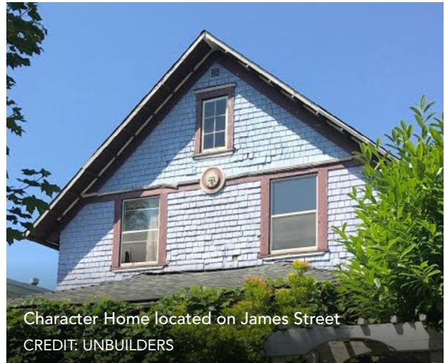
Character Home located on James Street

Unbuilders donated many of the materials to Habitat for Humanity, a non-profit organization. Some of the salvaged lumber was reused in the Welcome Parlour ice cream shop in North Vancouver.