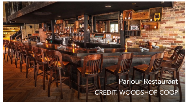
Parlour Restaurant