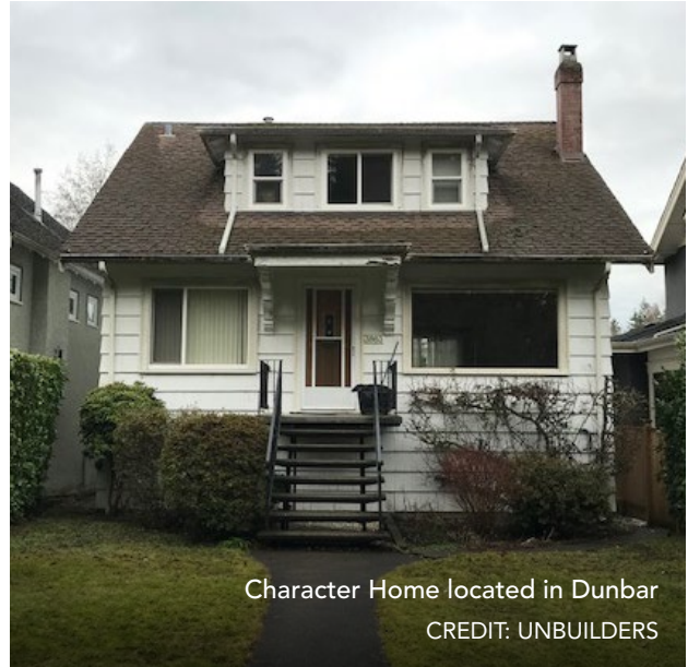
Character Home located in Dunbar

Lumber sales helped the owner offset the overall cost of deconstruction, making it comparable to traditional demolition.