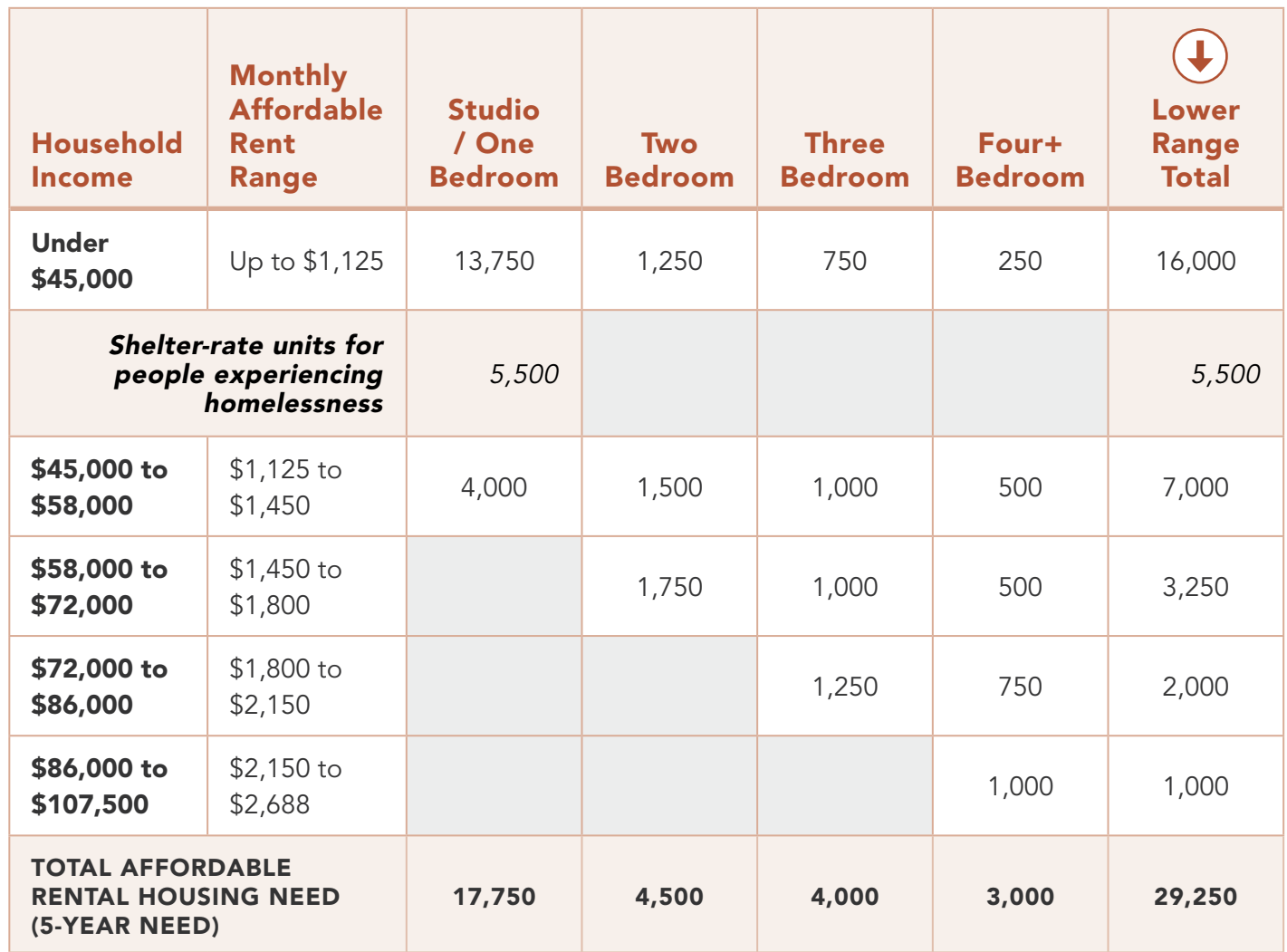
Table 2. Affordable Rental Housing Units Needed by Unit Size, Lower Range, Metro Vancouver, 5-Year Need*