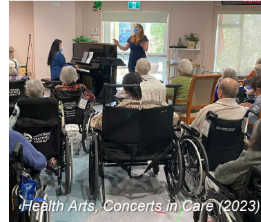
Health Arts, Concerts in Care (2023)