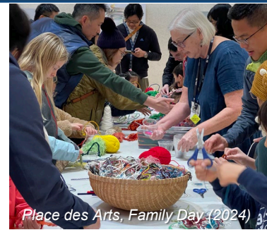
Place des Arts, Family Day (2024)