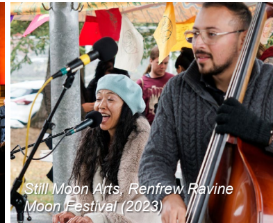
Still Moon Arts, Renfrew Ravine Moon Festival (2023)