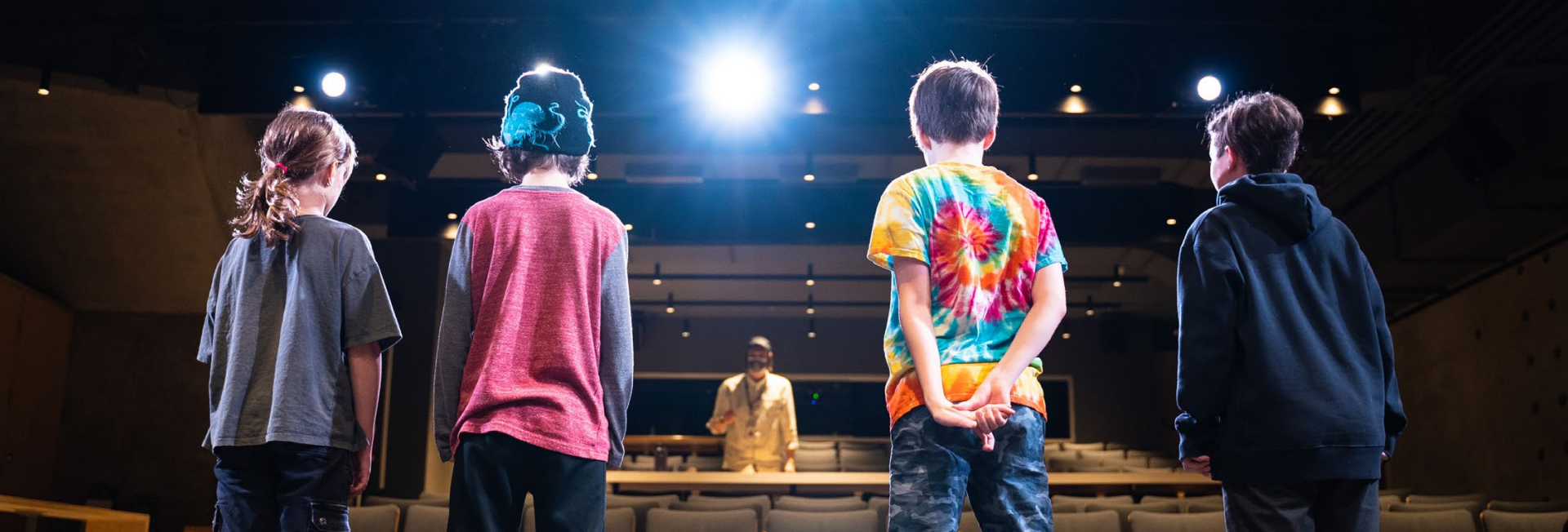
EcoTheatre 2022 Project