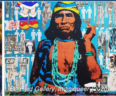
Bill Reid Gallery, Indigiqueer (2020)