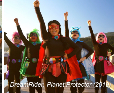
DreamRider, Planet Protector (2019)