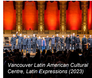
Vancouver Latin American Cultural Centre, Latin Expressions (2023)