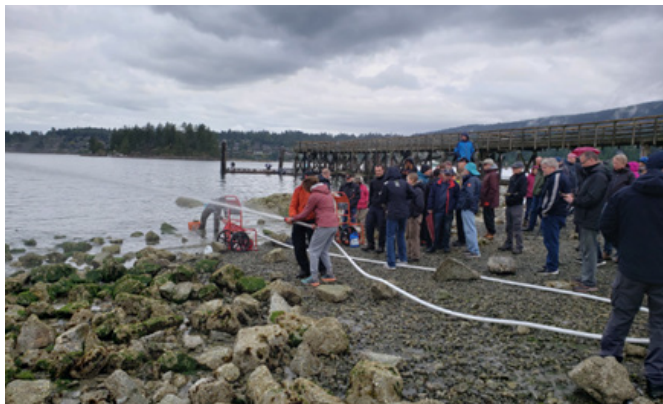
Indian Arm residents try out starting fire pumps, connecting hoses and aiming the fire hose.

On Saturday, May 25, Metro Vancouver staff along with the Sasamat Volunteer Fire Department led a hands-on FireSmart training session at t̓əmt̓əmíx̓w̓t̓ən/Belcarra Regional Park aimed at helping residents of water-access properties in Indian Arm prepare for emergencies.