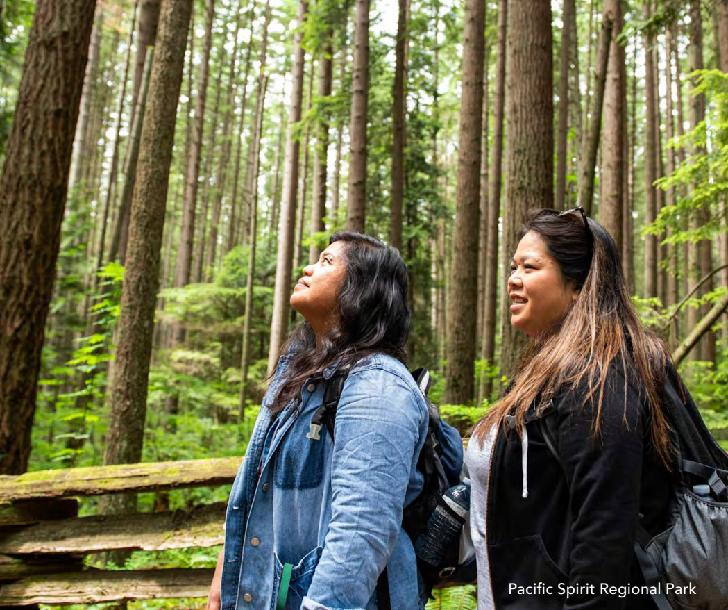
Pacific Spirit Regional Park