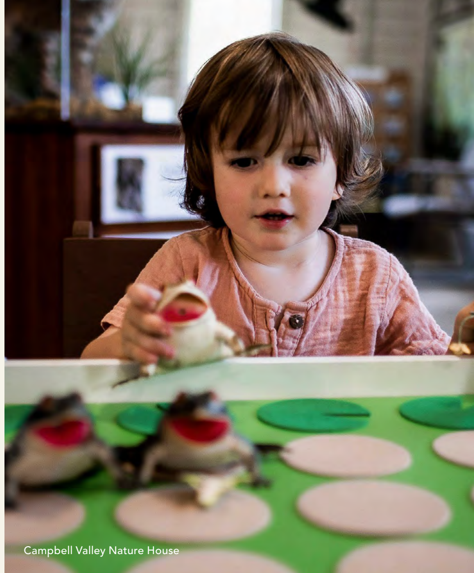
Campbell Valley Nature House