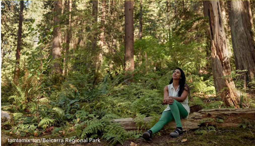
təmtəmixˈtən/Belcarra Regional Park

6974 Sat, May 4, 9:30 am – noon Ages 12+ DERBY REACH REGIONAL PARK, Langley $15 per adult, $7.50 per youth/adult 65+ Registration required