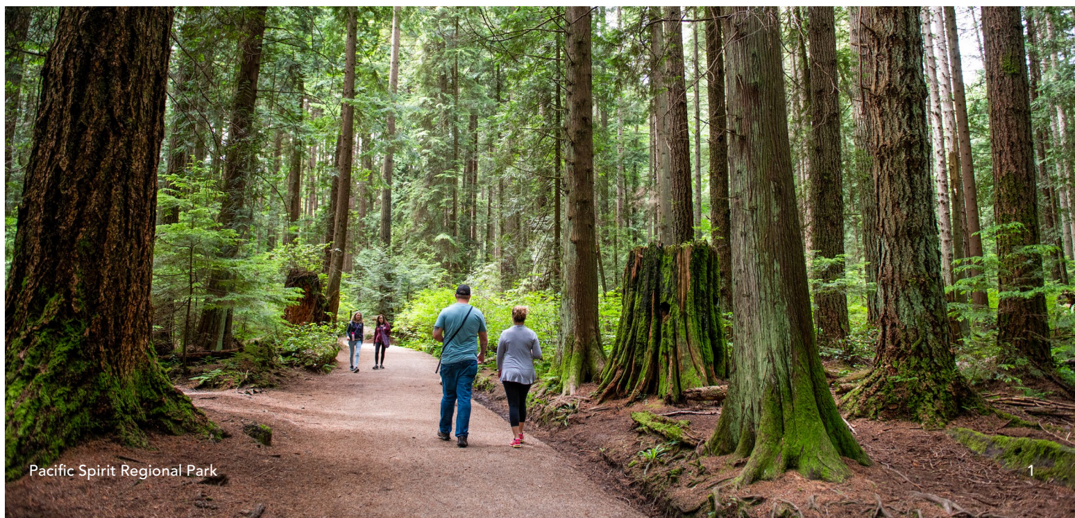
Pacific Spirit Regional Park

Metro Vancouver Metrotower III, 4515 Central Boulevard, Burnaby, BC, V5H 0C6