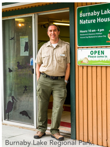
Burnaby Lake Regional Park

(search “Lynn Headwaters Visitor Centre”)