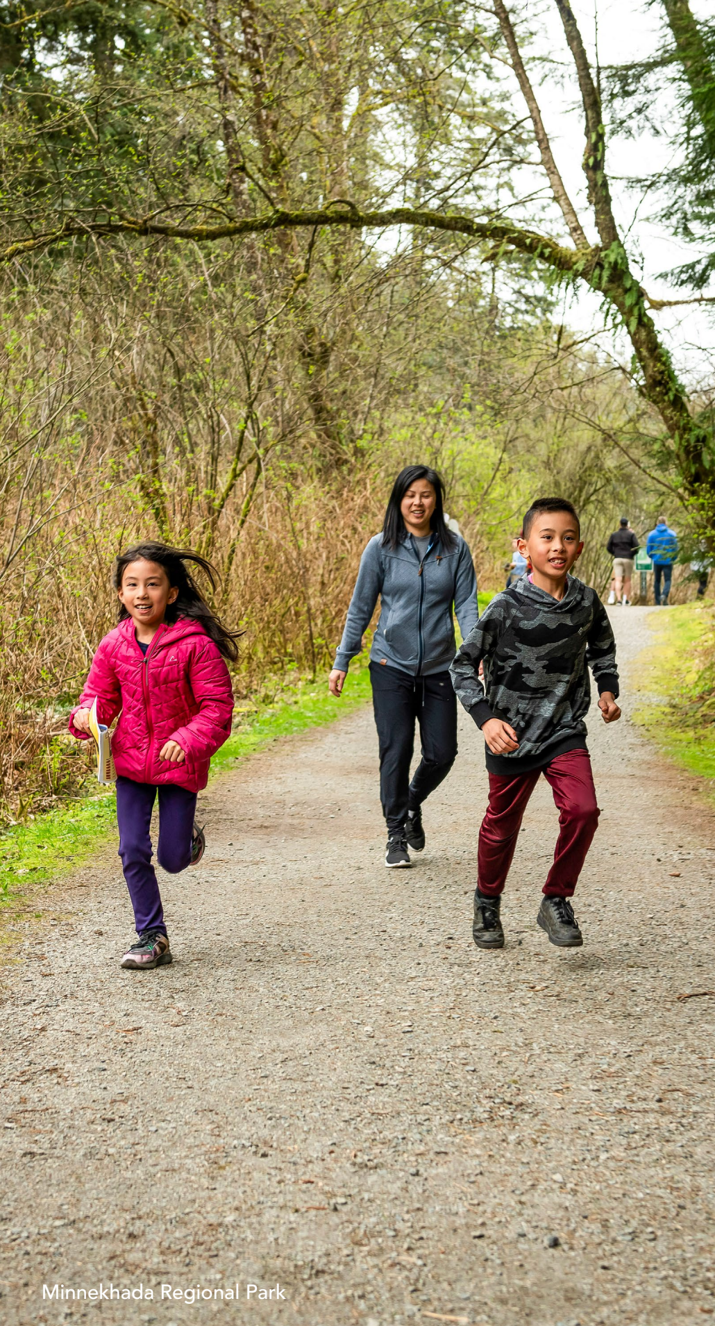
Minnehada Regional Park