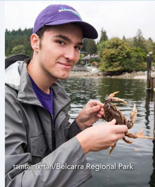
təmtəmixʷtən/Belcarra Regional Park