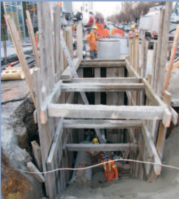
Separating combined sewers is a long-term program.