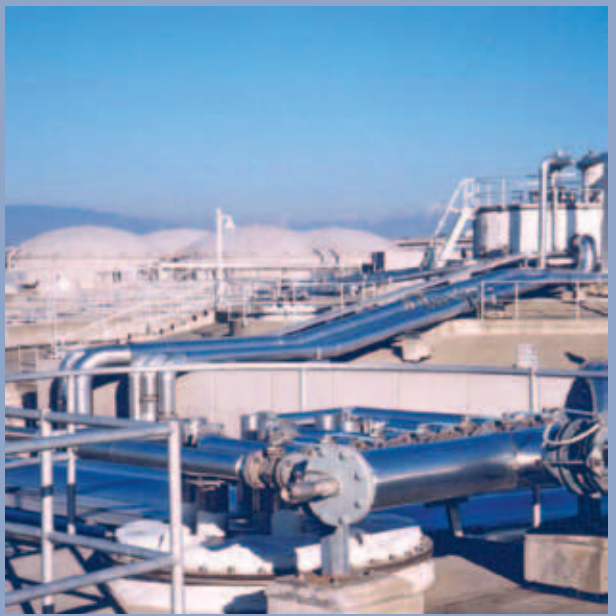
Annacis Island wastewater treatment plant provides treatment for over 1,000,000 people.

Metro Vancouver will increase enforcement of the Sewer Use Bylaw, improve source control tools and update outreach and education programs. Metro Vancouver and municipal actions will jointly seek to reduce groundwater and rainwater entering sanitary sewers over the long-term.