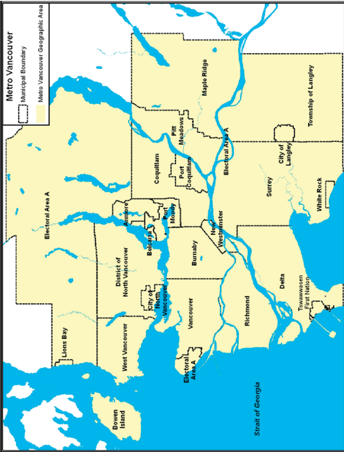
Figure 1 Metro Vancouver Member Municipalities and Electoral Area A