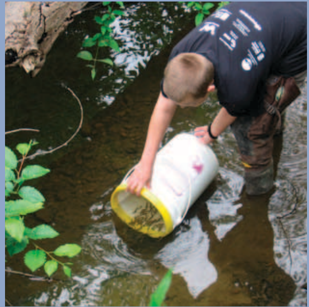
Releasing salmon fry, Silver Creek, Burnaby.

• Burrard Inlet Environmental Management Plan and Fraser River Estuary Management Plan: These are joint plans involving federal and provincial agencies, Metro Vancouver, municipalities and crown corporations. This plan supports the long-term goals of improving the health of Burrard Inlet and the Fraser River estuary by upgrading wastewater treatment plants, eliminating combined sewer overflows, improving stormwater management, and ongoing environmental monitoring.