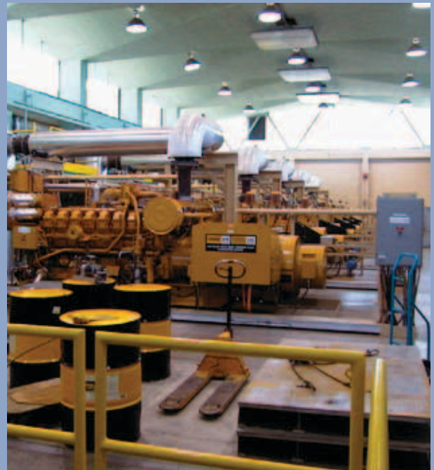
Biogas produced from wastewater supplies heat and power to the Iona Island wastewater treatment plant.

A major challenge for Metro Vancouver and its members will be to adapt the legacy sewerage and stormwater infrastructure of the 20th century to a more sustainable, integrated 21st century system focussed on integrated resource recovery. This will involve embracing new technologies and reshaping communities and their infrastructure so that the resources and energy recovered can be used efficiently and effectively: integrating a new kind of liquid waste infrastructure with building design, community and nature. This involves managing liquid wastes as a resource, minimizing discharges, minimizing financial risks, and maximizing the quality of discharges.