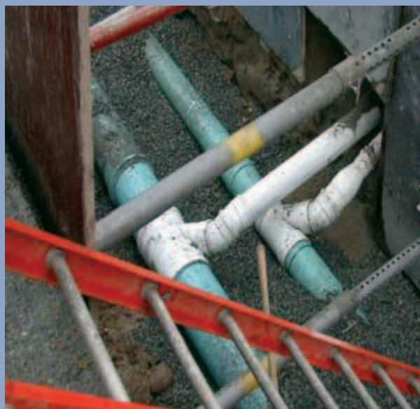
Private sewers connect homes and businesses to the municipal-regional sewer network.

plants, and develop associated target allowances for municipal sewer catchments associated with a 1:5 year return frequency storm event for sanitary sewers to a level that ensures environmental and economic sustainability. 2013