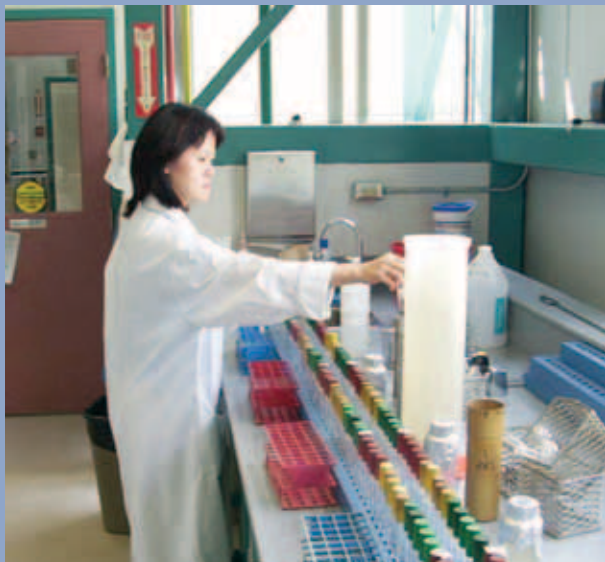
Monitoring at the Iona Island wastewater treatment plant laboratory.