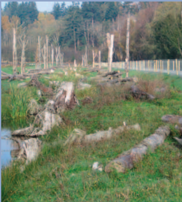
Flood management and constructed habitat, Eugene Creek, Surrey.

to ensure that Metro Vancouver's and senior governments' environmental and fiscal objectives and actions are mutually supportive and successful.