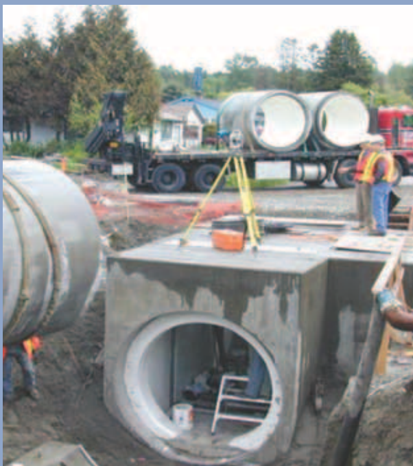
Installing Metro Vancouver trunk sewers, South Surrey.