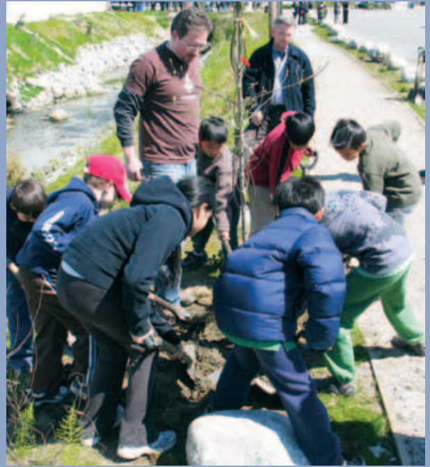
Trees improve habitat and reduce stormwater impacts, Still Creek, Vancouver.