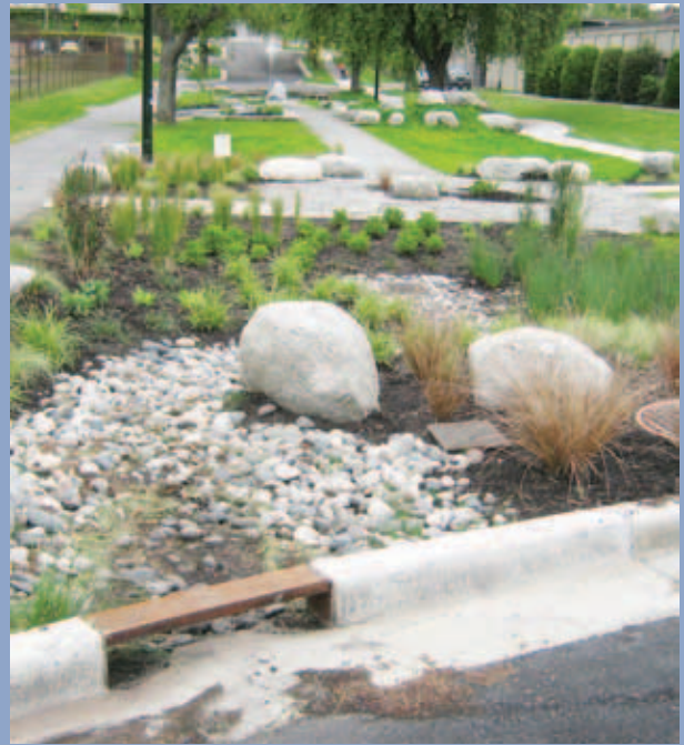
Rainwater infiltration treats stormwater and rebalances groundwater and creek flows.