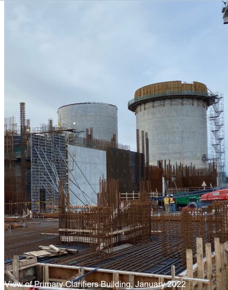
View of Primary Clarifiers Building, January 2022