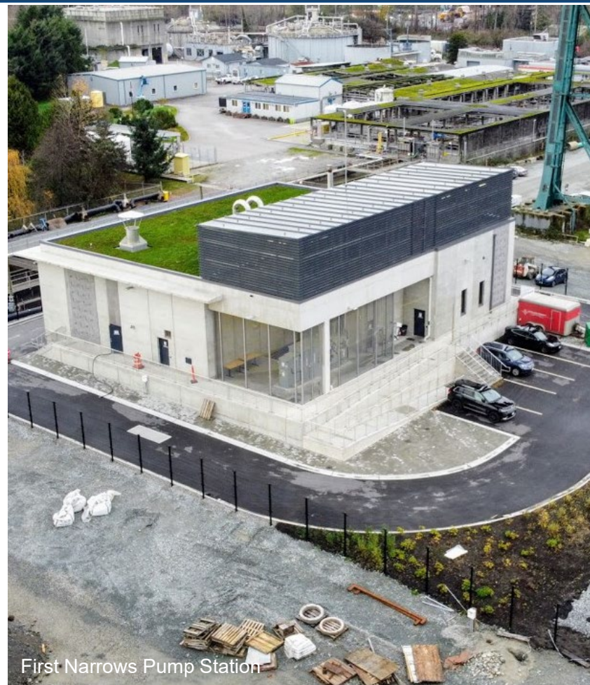
First Narrows Pump Station