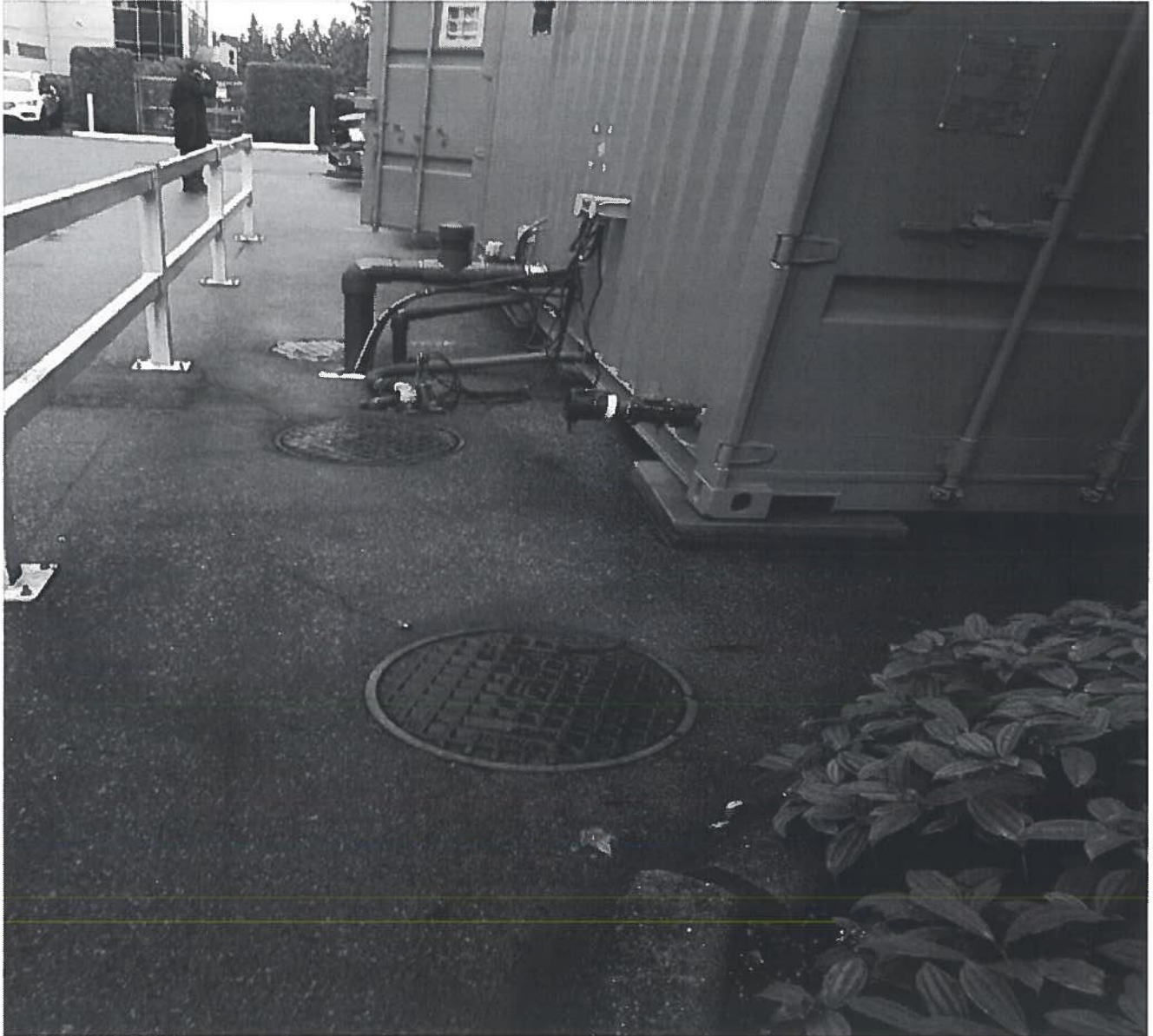
The "T" fitting on the grey pipe

Issued: July 31, 1997 Amended: May 02, 2019