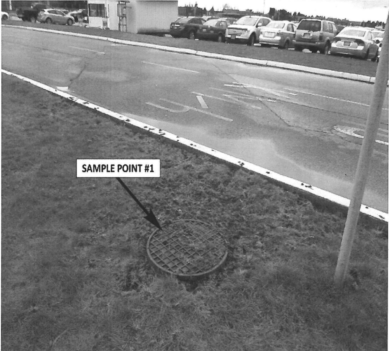
Photograph of Sample Point 1:

Issued: October 31, 1991 Amended: February 09, 2018