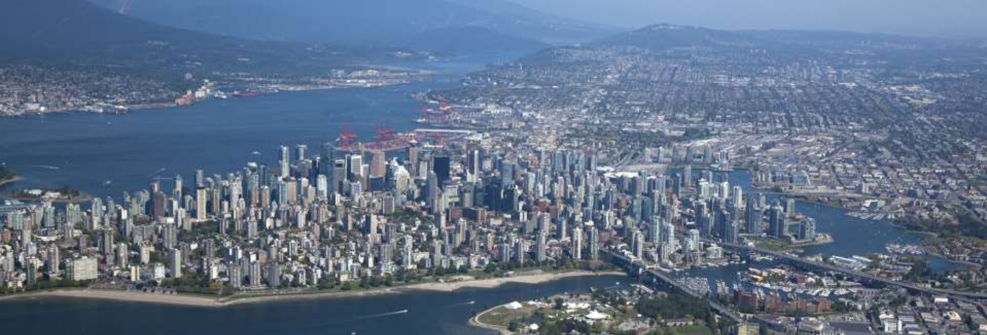
Aerial view of Burrard Inlet