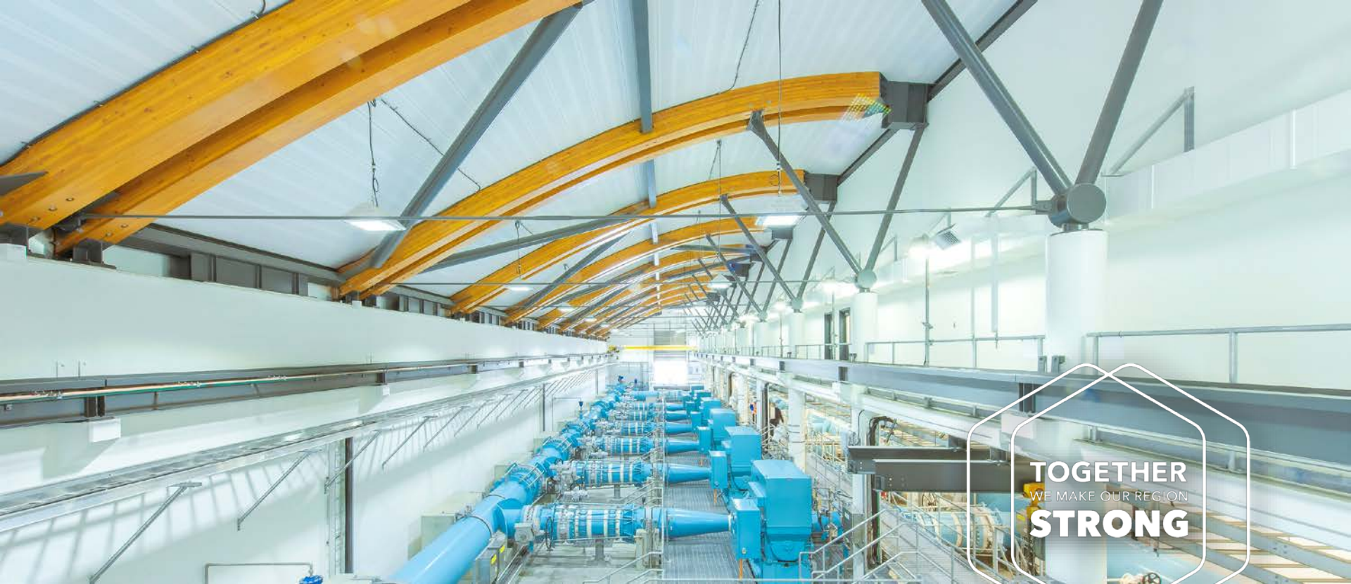
Barnston Maple Ridge Pump Station