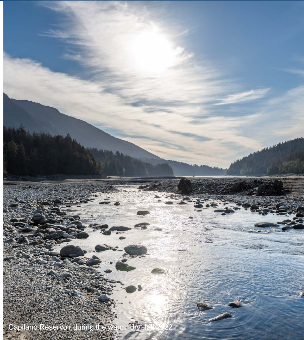
Capilano Reservoir during the warm, dry fall 2022