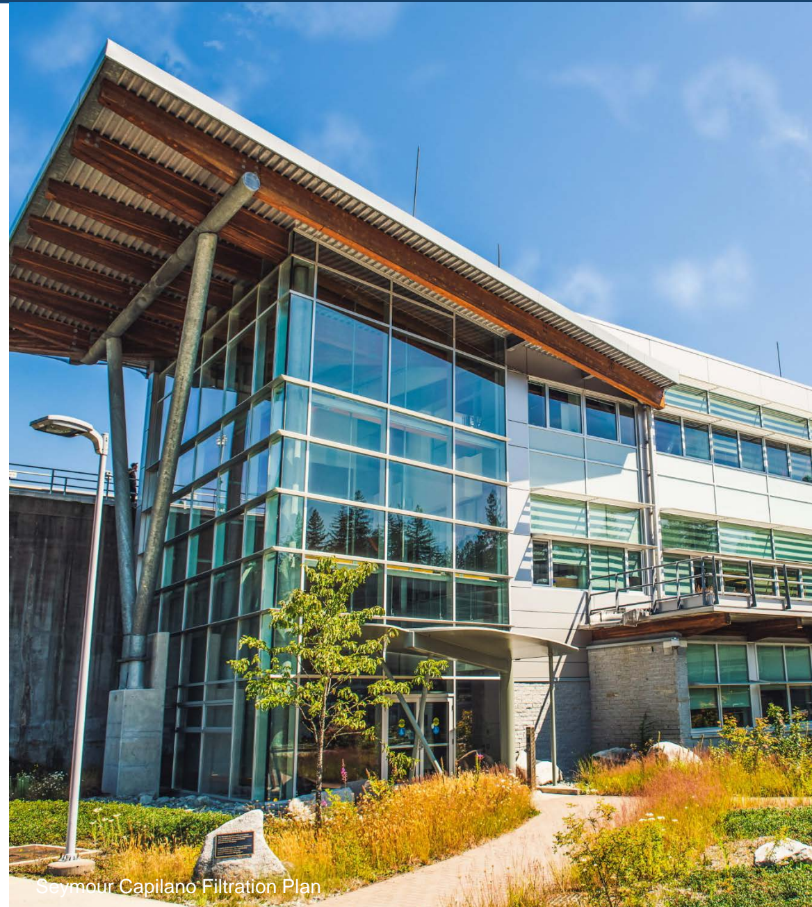
Seymour Capilano Filtration Plant