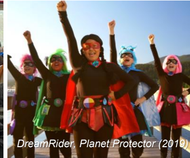
DreamRider, Planet Protector (2019)