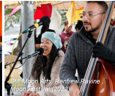
Still Moon Arts, Renfrew Ravine Moon Festival (2023)