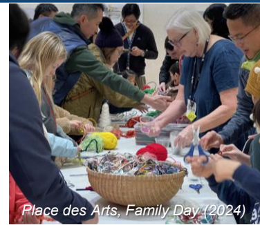
Place des Arts, Family Day (2024)