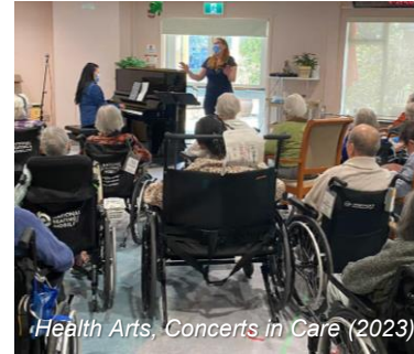
Health Arts, Concerts in Care (2023)