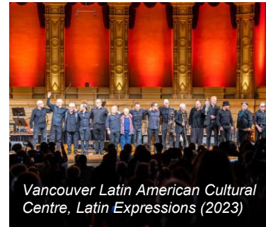
Vancouver Latin American Cultural Centre, Latin Expressions (2023)