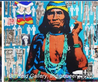
Bill Reid Gallery, Indigiqueer (2020)