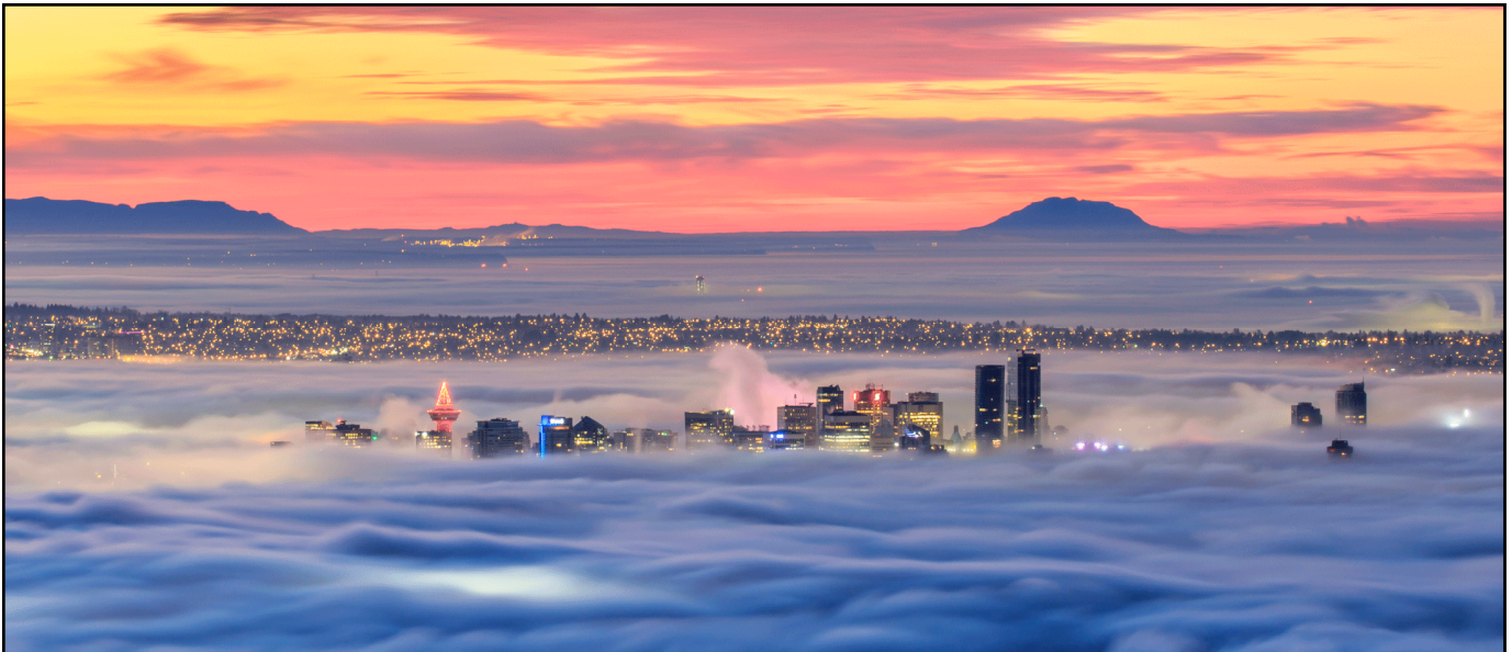
Metro Vancouver Skyline