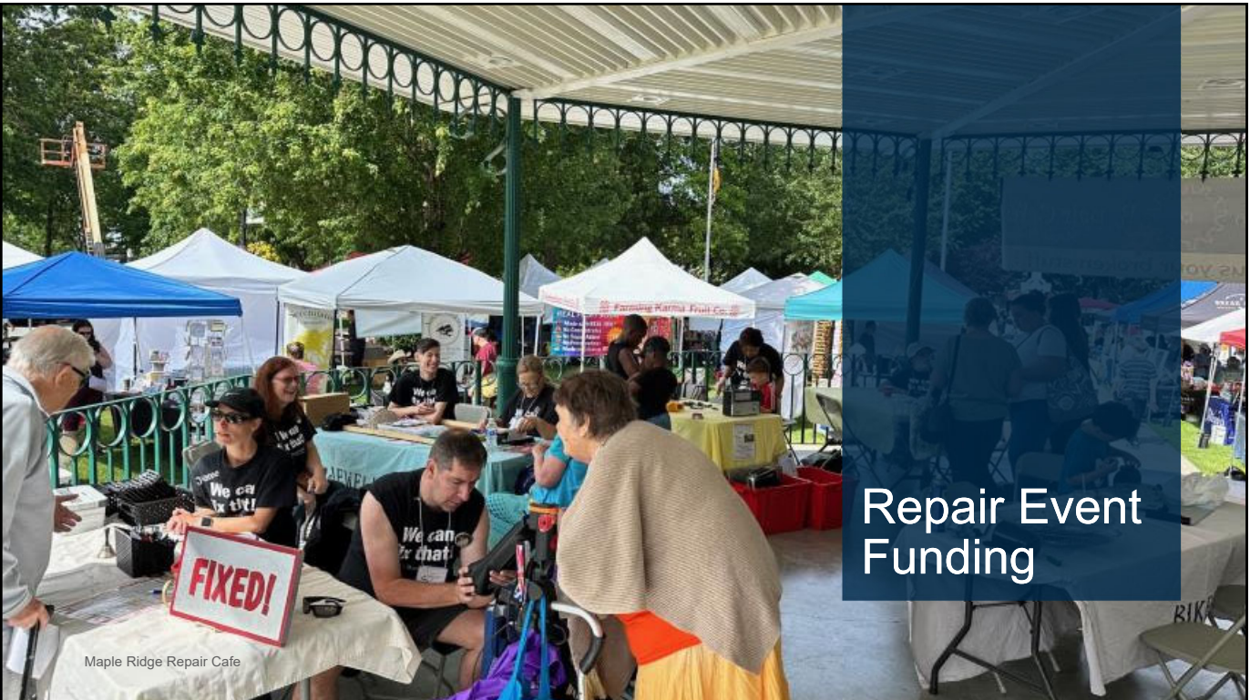
Maple Ridge Repair Cafe