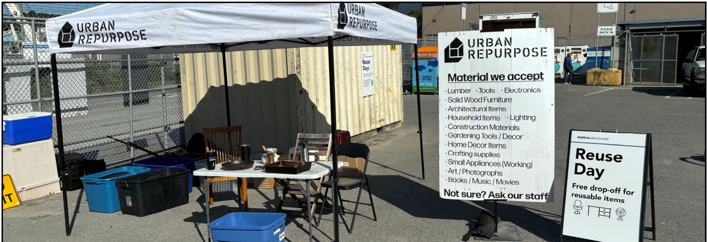
Reuse Day at North Shore Recycling and Waste Centre