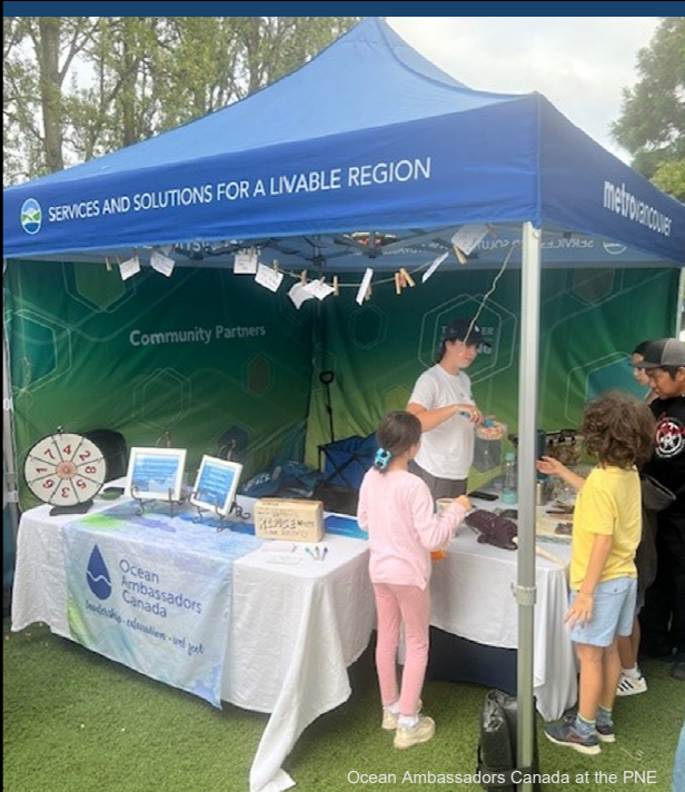
Ocean Ambassadors Canada at the PNE