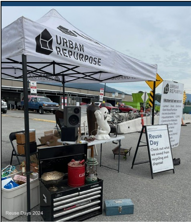
Reuse Days 2024