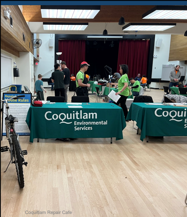
Coquitlam Repair Cafe