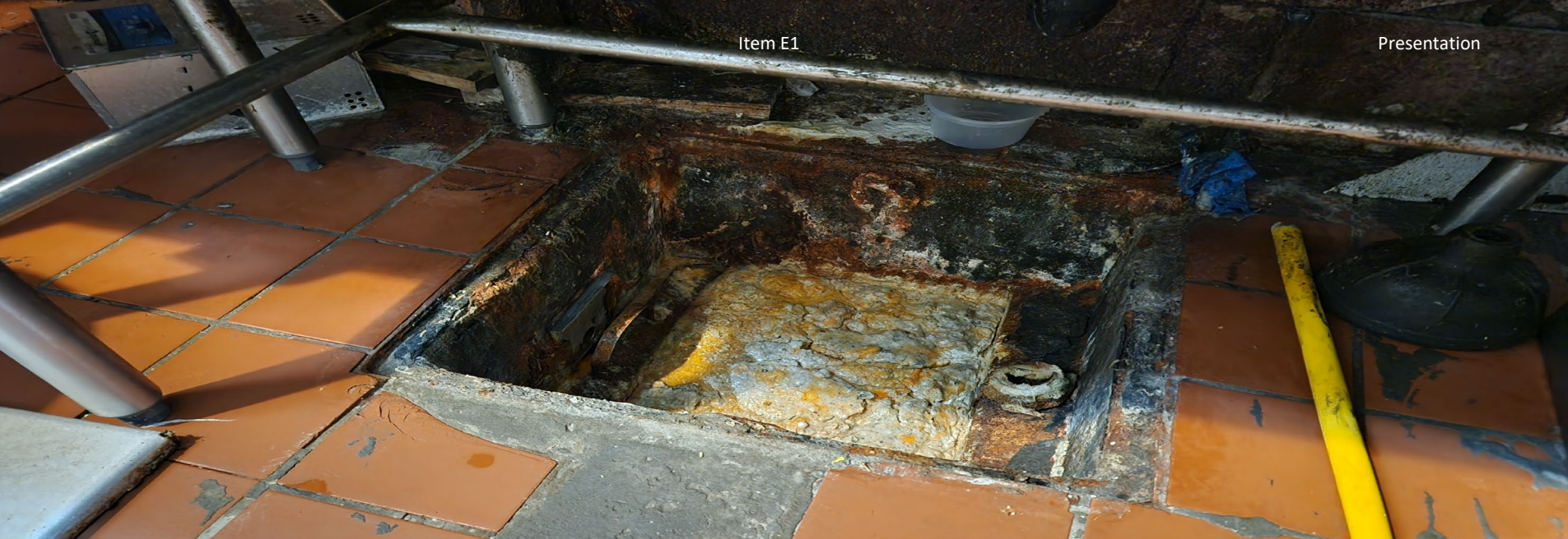
Food Sector Establishment Grease Interceptor