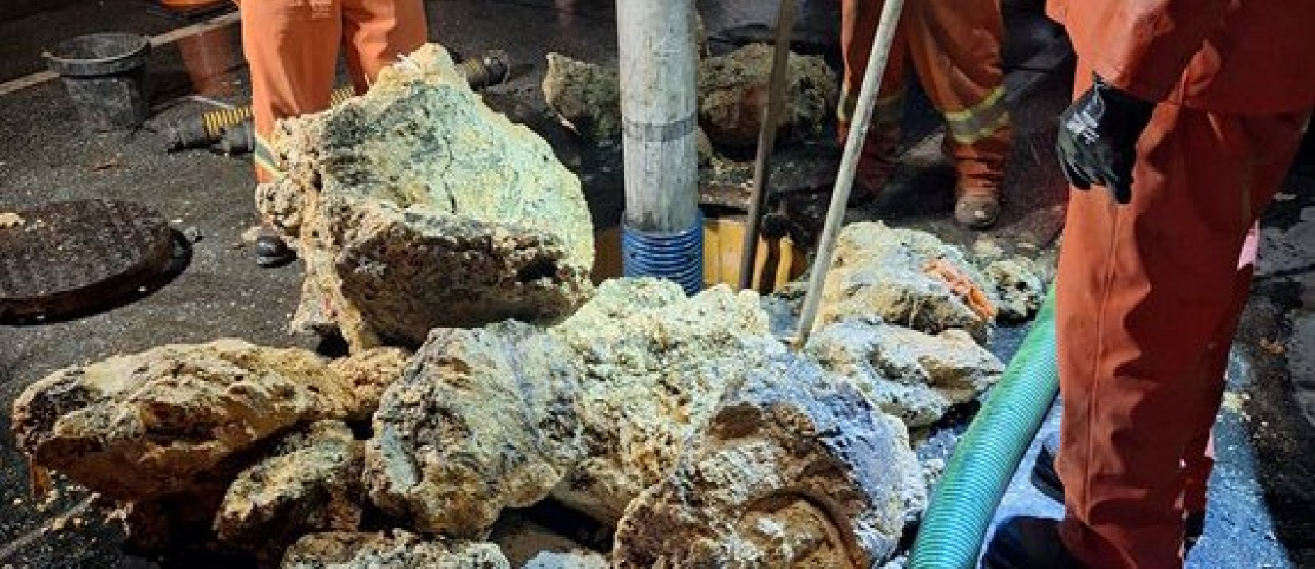
2024 Richmond FOG removal