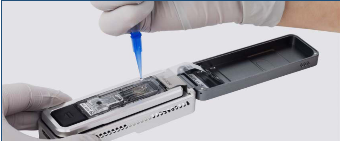
Figure 1: Oxford Nanopore Technologies MinION portable DNA sequencing device.