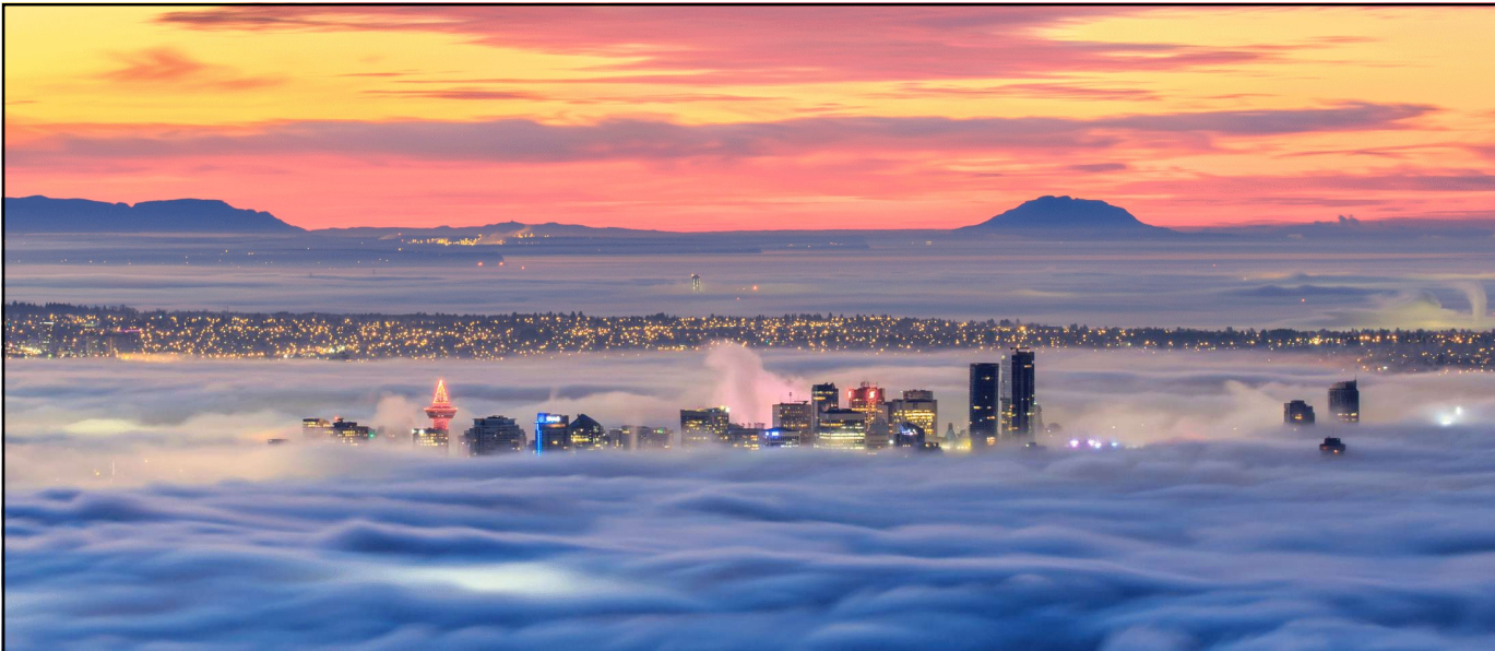
Metro Vancouver Skyline