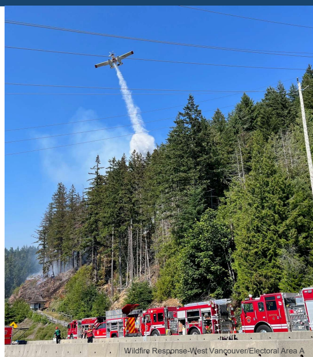
Wildfire Response-West Vancouver/Electoral Area A