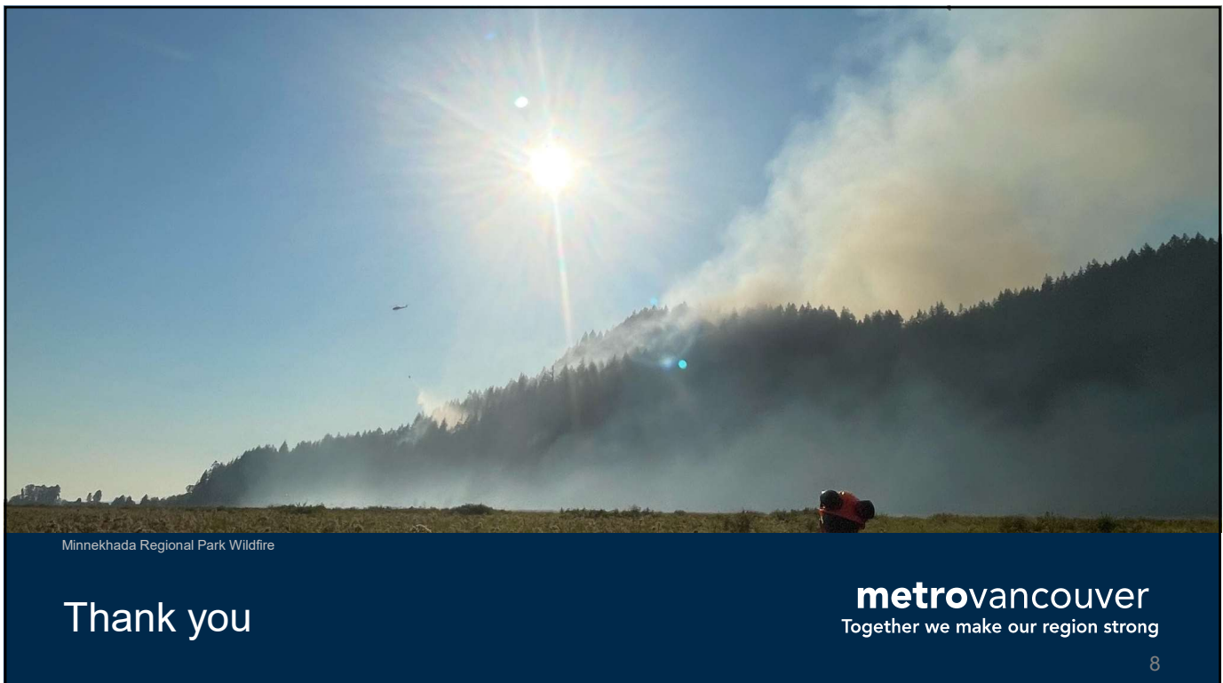
Minnekhada Regional Park Wildfire