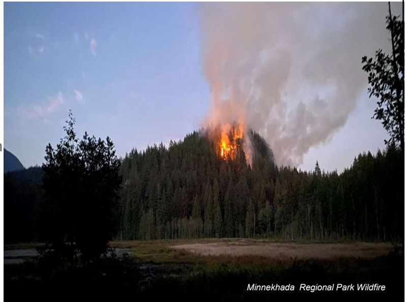
Minnekhada Regional Park Wildfire