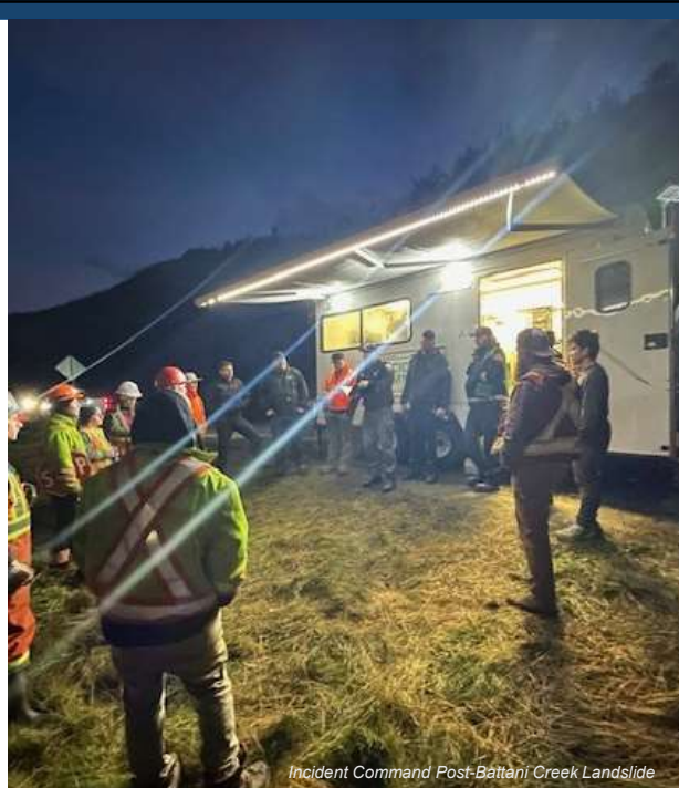
Incident Command Post-Battani Creek Landslide